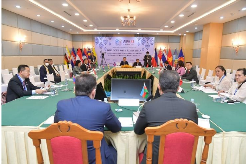
บรรยากาศการประชุมหารือระหว่างประเทศสมาชิก AIPA และคณะผู้แทนรัฐสภาสาธารณรัฐอาเซอร์ไบจาน

การพัฒนาที่ยั่งยืน และการฟื้นฟูภายหลังโรคโควิด-19 รวมถึงการเสริมสร้างความร่วมมือและแบ่งปันแนวปฏิบัติเป็นเลิศร่วมกัน ทั้งนี้ ผู้แทนรัฐสภาไทยได้แสดงความขอบคุณสภาสาธารณรัฐอาเซอร์ไบจานที่มุ่งมั่นในการมีส่วนร่วมในกิจกรรมของ AIPA โดยเฉพาะอย่างยิ่งในการขอการรับรองสถานะประเทศผู้สังเกตการณ์ของ AIPA อย่างเป็นทางการ โดยหวังว่าการแลกเปลี่ยนและการหารือในครั้งนี้ จะทำให้ความสัมพันธ์ระหว่างประเทศสมาชิก AIPA และอาเซอร์ไบจานมีความแน่นแฟ้นยิ่งขึ้น