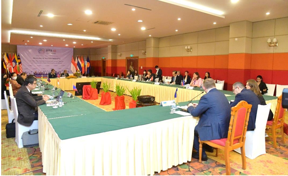
บรรยากาศการประชุมหารือระหว่างประเทศสมาชิก AIPA และคณะผู้แทนรัฐสภายูเครน

เพื่อกระจายความเจริญสู่ภูมิภาค ด้วยความพยายามร่วมกันจะสามารถกระชับความสัมพันธ์ระหว่างยูเครนกับไทยต่อไป เพื่อประโยชน์ของประชาชนทั้งสองประเทศ