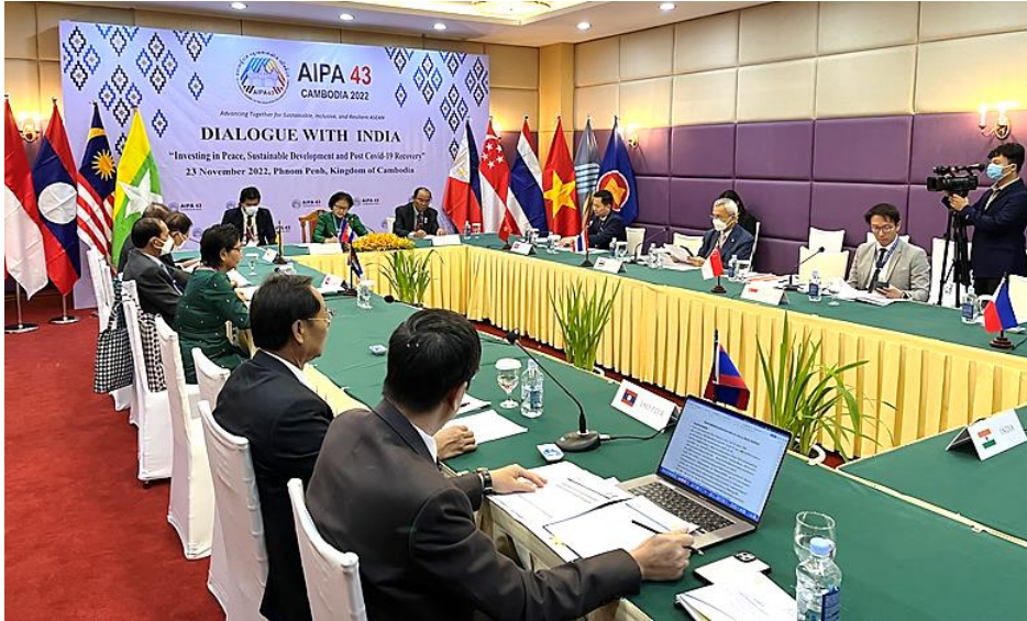
บรรยากาศการประชุมหารือระหว่างคณะผู้แทนประเทศสมาชิก AIPA กับคณะผู้แทนรัฐสภาอินเดีย