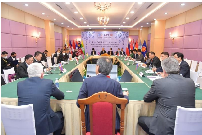
บรรยากาศการประชุมหารือระหว่างประเทศสมาชิก AIPA และคณะผู้แทนรัฐสภาแคนาดา

นอกจากนี้ ประเทศไทยขอขอบคุณการสนับสนุนของประเทศแคนาดาเกี่ยวกับการพัฒนาศักยภาพของมนุษย์ผ่านโครงการทุนการศึกษาแคนาดา – อาเซียนและการแลกเปลี่ยนทางการศึกษาเพื่อการพัฒนา (The Canada-ASEAN Scholarships and Educational Exchanges for Development (SEED) Program) ทั้งนี้ ในโอกาสครบรอบ ๖๐ ปีของการสถาปนาความสัมพันธ์ทางการทูตระหว่างประเทศไทยและแคนาดา ประเทศไทยยินดีที่ทั้งสองประเทศมีความร่วมมือกันในหลายด้าน อาทิ การทหาร เศรษฐกิจ และการศึกษา นอกจากนี้ ประเทศไทยยังสนับสนุนการแลกเปลี่ยนการเยือนระหว่างคณะผู้แทนสมาชิกรัฐสภาอาเซียนและแคนาดา เพื่อส่งเสริมความเข้าใจและเสริมสร้างความร่วมมือให้มากยิ่งขึ้นระหว่างกัน