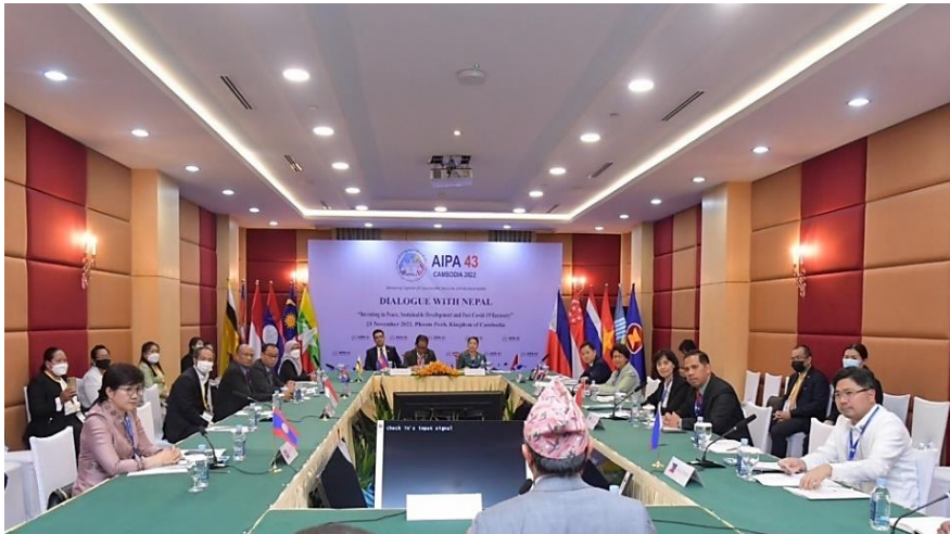
บรรยากาศการประชุมหารือระหว่างประเทศสมาชิก AIPA และคณะผู้แทนรัฐสภาเนปาล