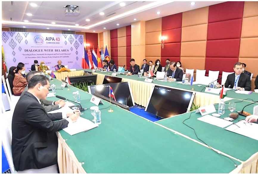
บรรยากาศการประชุมหารือระหว่างประเทศสมาชิก AIPA และคณะผู้แทนรัฐสภาสาธารณรัฐเบลารุส