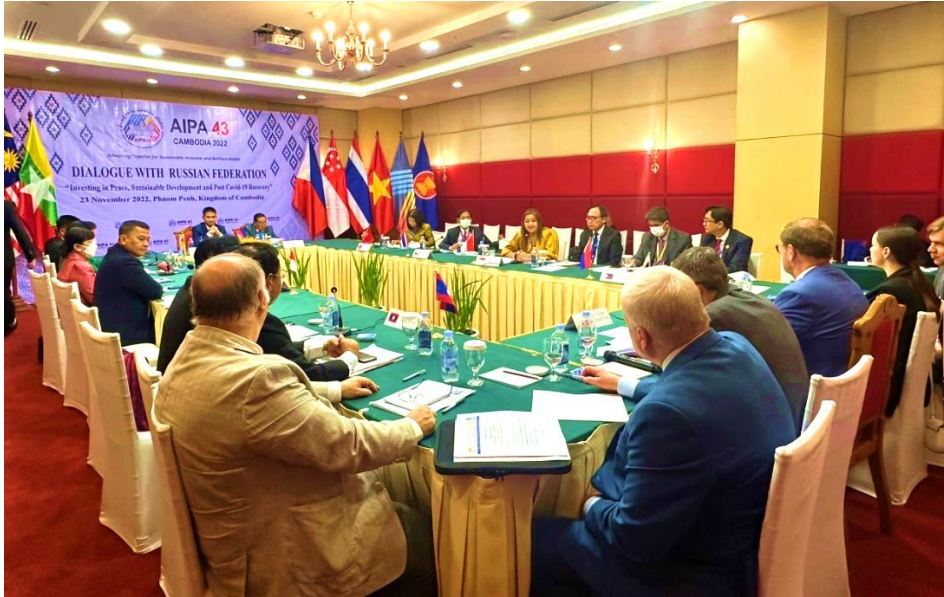
บรรยากาศการประชุมหารือระหว่างประเทศสมาชิก AIPA และคณะผู้แทนรัฐสภารัสเซีย