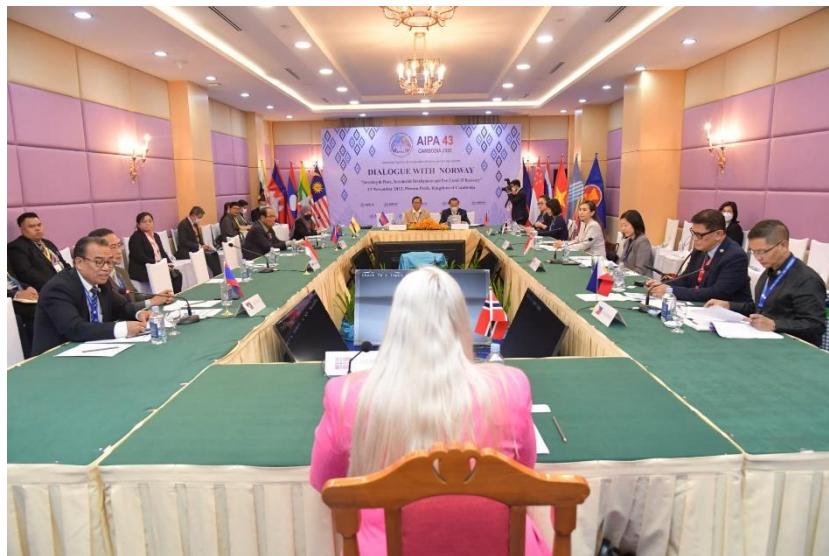
บรรยากาศการประชุมหารือระหว่างประเทศสมาชิก AIPA และคณะผู้แทนรัฐสกาโนร์เวย์