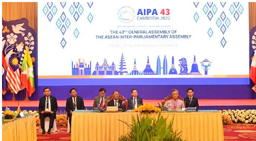
นายชวน หลีกภัย ประธานรัฐสภา ได้รับแต่งตั้งให้เป็น รองประธานการประชุมคณะกรรมการบริหาร

ตามธรรมนูญ AIPA ข้อ ๑๑ ระบุว่า การเลือกตั้งรองประธานกรรมการบริหารให้กระทำในที่ประชุมคณะกรรมการบริหารแต่ละครั้ง ที่ประชุมฯ ได้เห็นพ้องกันแต่งตั้งให้นายชวน หลีกภัย ประธานรัฐสภา เป็นรองประธานการประชุม