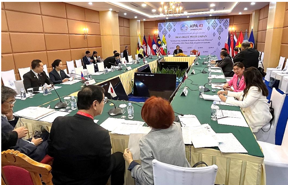
บรรยากาศการประชุมหารือระหว่างคณะผู้แทนประเทศสมาชิก AIPA กับคณะผู้แทนรัฐสภาญี่ปุ่น

ที่ประชุมฯ ได้หารือร่วมกันภายใต้หัวข้อ “การเจรจาเพื่อสันติภาพ การพัฒนาที่ยั่งยืน และการฟื้นฟูภายหลังโรคโควิด-19” ทั้งนี้ คณะผู้แทนรัฐสภาไทยได้กล่าวถึงความสัมพันธ์และความร่วมมือระหว่างอาเซียนกับญี่ปุ่นที่มีมาอย่างยาวนานต่อเนื่องโดยเฉพาะด้านความร่วมมือทางเศรษฐกิจที่มีอยู่หลายกรอบด้วยกันทั้งแบบทวิภาคีและแบบพหุภาคี คณะผู้แทนฯ ยังกล่าวถึงประเด็นเกี่ยวกับโควิด-19 ที่ส่งผลกระทบต่อทางเศรษฐกิจและสังคมซึ่งการหาแนวทางเชิงรุกในการตอบสนองและฟื้นตัวอย่างรวดเร็วจาก COVID-19 จึงยังคงเป็นสิ่งที่จำเป็น นอกจากนี้ คณะผู้แทนฯ ยังได้กล่าวถึงอุตสาหกรรมการท่องเที่ยวของไทยและญี่ปุ่นว่า ในปัจจุบันสถานการณ์โควิด-19 ที่เริ่มผ่อนคลายมากขึ้นกับรัฐบาลได้มีการเปิดประเทศแล้วจึงส่งผลให้นักท่องเที่ยวเริ่มเดินทางท่องเที่ยวร่วมกันอีกครั้ง ที่ผ่านมามีเห็นได้ว่าคนไทยนิยมเดินทางไปเที่ยวประเทศญี่ปุ่นและคนญี่ปุ่นก็ชื่นชอบในการเดินทางมาเที่ยวประเทศไทยเช่นกัน ด้วยเหตุนี้ รัฐบาลไทยได้มีการยกเลิกข้อจำกัดการเดินทางและข้อกำหนดการเข้าเมืองสำหรับชาวญี่ปุ่นหลายข้อซึ่งทำให้นักท่องเที่ยวชาวญี่ปุ่นสามารถเดินทางได้ง่ายขึ้น