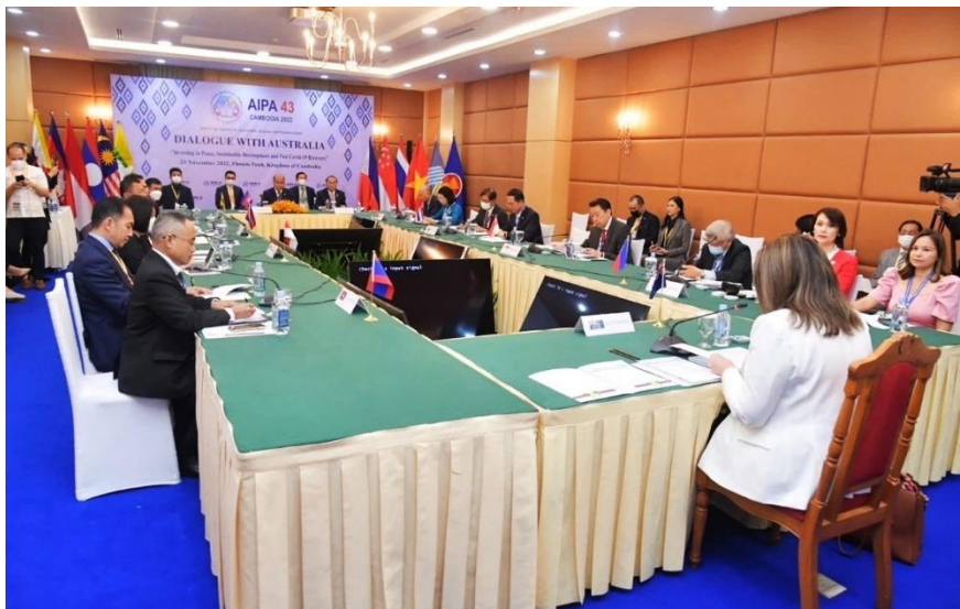
บรรยากาศการประชุมหารือระหว่างประเทศสมาชิก AIPA และคณะผู้แทนรัฐสภาเครือรัฐออสเตรเลีย

นอกจากนี้ ผู้แทนรัฐสภาไทย ได้เน้นย้ำและสนับสนุนความร่วมมือระหว่างออสเตรเลียและอาเซียนในด้านต่าง ๆ อาทิ การเพิ่มการเยือนระหว่างกัน การยกระดับเขตการค้าอาเซียน-ออสเตรเลีย-นิวซีแลนด์ การศึกษาและการพัฒนาทรัพยากรมนุษย์ อุตสาหกรรมการแพทย์และสุขภาพ การพัฒนาพลังงานทดแทน การพัฒนาเศรษฐกิจดิจิทัล การประยุกต์ใช้โมเดลเศรษฐกิจชีวภาพ-เศรษฐกิจหมุนเวียน-เศรษฐกิจสีเขียว (Bio-Circular-Green economy: BCG Model) การแก้ปัญหาอาชญากรรมข้ามชาติ เช่น การปราบปรามการค้ามนุษย์และการลักลอบเข้าเมือง และเน้นย้ำความร่วมมือระหว่างรัฐสภาตามกรอบ AIPA และ APPF รวมถึงการสนับสนุนและแบ่งปันแนวปฏิบัติที่เป็นเลิศในการพัฒนาห้องสมุดกฎหมายดิจิทัล