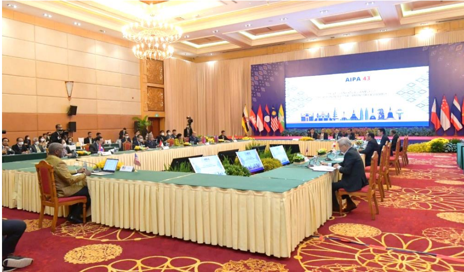
บรรยากาศการประชุมหารือระหว่างประเทศสมาชิก AIPA และคณะผู้แทนรัฐสภาสหรัฐอเมริกา

ที่มุ่งพัฒนาทักษะของเจ้าหน้าที่ในการช่วยเหลืองานด้านนิติบัญญัติแก่สมาชิกรัฐสภาเพื่อประโยชน์สูงสุดของประชาชน ด้านสหรัฐอเมริกา ได้เน้นย้ำถึงความสำคัญของภูมิภาคเอเชียตะวันออกเฉียงใต้ ผ่านความร่วมมือรูปแบบต่าง ๆ ไม่ว่าจะเป็นกรอบของ AIPA ASEAN ARF APEC หรือกรอบใด ๆ ก็ตาม และพร้อมให้ความร่วมมือในทุกด้าน