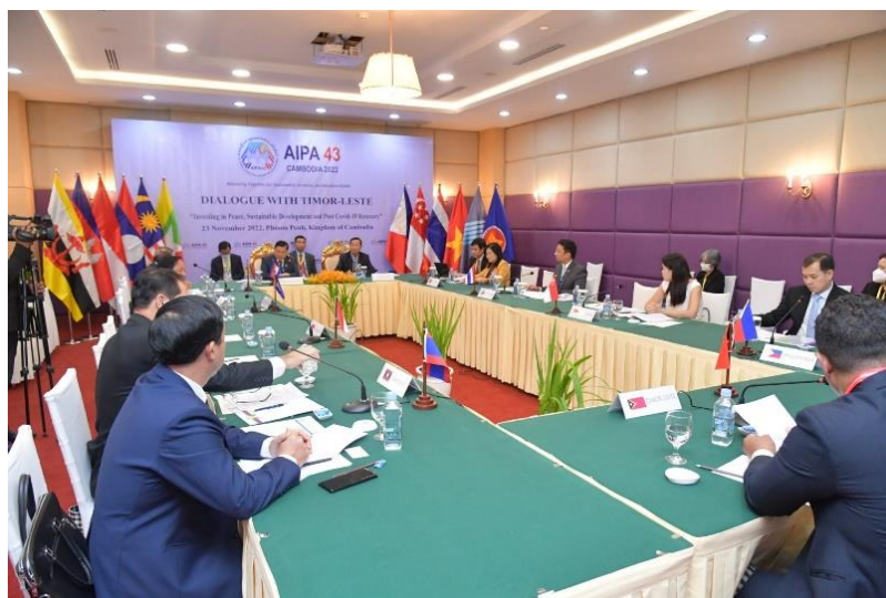
บรรยากาศการประชุมหารือระหว่างประเทศสมาชิก AIPA และคณะผู้แทนรัฐสภาติมอร์ เลสเต

คณะผู้แทนรัฐสภาไทยยังได้กล่าวแสดงความยินดีในโอกาสครบรอบ ๒๐ ปีของการสถาปนาความสัมพันธ์ทางการทูตระหว่างประเทศไทยและติมอร์ เลสเต ในช่วงที่ผ่านมาทั้งสองประเทศได้มีความสัมพันธ์ที่ใกล้ชิดและมีการแลกเปลี่ยนการเยือน รวมทั้งความร่วมมือระหว่างกันในฐานะหุ้นส่วนเพื่อการพัฒนา โดยประเทศไทยสนับสนุนการขยายความร่วมมือของทั้งสองประเทศในด้านต่าง ๆ อาทิ การค้าการลงทุน การศึกษาและวิชาการ รวมทั้ง การพัฒนาทรัพยากรมนุษย์ นอกจากนี้ ยังสนับสนุนให้มีการแลกเปลี่ยนการเยือนระหว่างคณะผู้แทนสมาชิกรัฐสภาอาเซียนและติมอร์ เลสเต เพื่อเสริมสร้างความร่วมมือและความสัมพันธ์ที่มากขึ้นระหว่างกัน