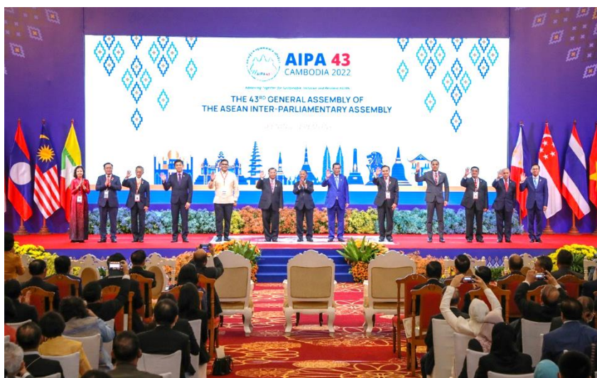
หัวหน้าคณะผู้แทนรัฐสภาจากประเทศสมาชิก AIPA ถ่ายรูปร่วมกันในช่วงพิธีเปิดการประชุม

พิธีเปิดการประชุมจัดขึ้นในวันจันทร์ที่ ๒๑ พฤศจิกายน ๒๕๖๕ เวลา ๐๙.๓๐ – ๑๑.๓๐ นาฬิกา ณ ห้อง Ballroom I & II โดยพิธีเริ่มด้วยการเปิดเพลง AIPA ต่อด้วยวิดิทัศน์พระราชดำรัสของพระบาทสมเด็จพระบรมชนกาธิเบศร มหาภูมิพลอดุลยเดชมหาราช บรมนาถบพิตร สี่หมื่นปี กษัตริย์แห่งราชอาณาจักรกัมพูชา ซึ่งพระองค์ได้ทรงกล่าวถึงหัวใจหลักของการประชุมว่า “ก้าวไปด้วยกัน เพื่ออาเซียนที่ยืดหยุ่น ครอบคลุม และยั่งยืน” นั้นสอดคล้องกับสถานการณ์ปัจจุบันของอาเซียนที่ทุกประเทศต่างร่วมกันส่งเสริมความร่วมมือระหว่างกันในทุกมิติเพื่อความเจริญก้าวหน้าของทุกประเทศอย่างมั่นคงและยั่งยืน จากนั้นเป็นการแสดงทางวัฒนธรรมของเจ้าภาพ ต่อด้วยการกล่าวต้อนรับโดย สมเด็จพระเจ็ทวิบูลเสนาภักดี สาย ฌุม ประธานพหุสภาแห่งราชอาณาจักรกัมพูชา หลังจากนั้นเป็นการกล่าวสุนทรพจน์พิธีเปิดโดยสมเด็จพระเจ้าอัครมหาเสนาบดีเดโช ฮุน เซน นายกรัฐมนตรีแห่งราชอาณาจักรกัมพูชาและประธานอาเซียน ต่อด้วยการกล่าวเปิดการประชุมโดยสมเด็จพระเจ้าอัครมหาพญาจักรี เฮง สัมริน ประธานสภาแห่งชาติราชอาณาจักรกัมพูชาและประธานสมัชชารัฐสภาอาเซียน