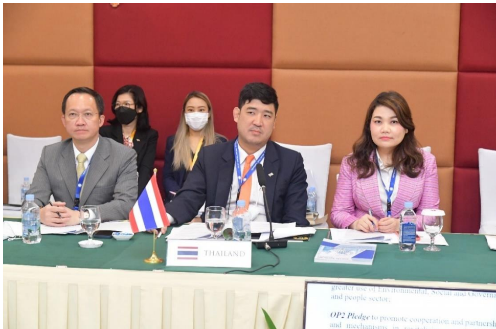
นายอัครเดช วงษ์พิทักษ์โรจน์ สมาชิกสภาผู้แทนราษฎร ผู้แทนรัฐสภาไทย (ซ้าย) นายเท่าพิภพ ลิ้มจิตรกร สมาชิกสภาผู้แทนราษฎร หัวหน้าคณะผู้แทนรัฐสภาไทย ในการประชุมคณะกรรมการด้านเศรษฐกิจ (กลาง) นางสาววิไลลักษณ์ อรินทมะพงษ์ สมาชิกวุฒิสภา ผู้แทนรัฐสภาไทย (ขวา)