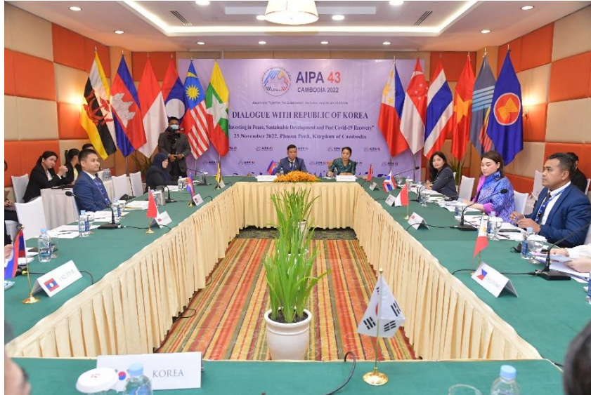
บรรยากาศการประชุมหารือระหว่างประเทศสมาชิก AIPA และคณะผู้แทนรัฐสภาสาธารณรัฐเกาหลี