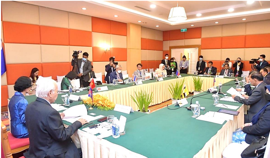
บรรยากาศการประชุมหารือระหว่างประเทศสมาชิก AIPA และคณะผู้แทนรัฐสภาสาธารณรัฐอิสลามปากีสถาน

ที่ผ่านมา และได้กล่าวแสดงความยินดีต่อการเป็นหุ้นส่วนที่เป็นมิตรระหว่างปากีสถานและสมาชิกรัฐสภาอาเซียน คณะผู้แทนฯ ยังได้กล่าวถึงประเด็นเกี่ยวกับโควิด-19 ที่ส่งผลกระทบต่อเศรษฐกิจและสังคม ซึ่งจำเป็นต้องหาแนวทางเชิงรุกในการฟื้นฟูโดยเร็ว นอกจากนี้ ไทยมีความพร้อมที่จะช่วยสนับสนุน การพัฒนาความร่วมมือให้เกิดขึ้น เพื่อนำไปสู่การพัฒนาที่ยั่งยืน โดยเฉพาะอย่างยิ่งการแลกเปลี่ยนเทคโนโลยี และข้อมูลข่าวสารระหว่างกัน