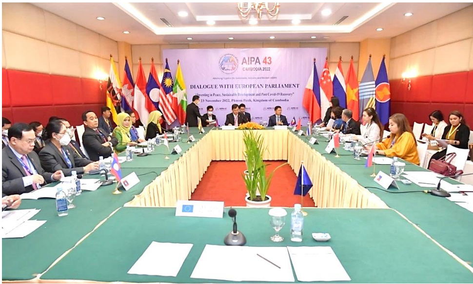
บรรยากาศการประชุมหารือระหว่างประเทศสมาชิก AIPA และคณะผู้แทนสหภาพยุโรป

ในขณะเดียวกันไทยก็จะสามารถนำเสนอแนวปฏิบัติที่เป็นเลิศ ความเชี่ยวชาญและแนวคิดด้านต่าง ๆ ของไทย อาทิ ด้านสาธารณสุข (หลักประกันสุขภาพถ้วนหน้า) และแนวคิดเศรษฐกิจชีวภาพ เศรษฐกิจหมุนเวียนและเศรษฐกิจสีเขียว (Bio-Circular-Green (BCG) Economy) ซึ่งสอดคล้องกับแนวทางของสหภาพยุโรปตามแผนปฏิรูปยุโรปสีเขียว (European Green Deal: EGD) และการเปลี่ยนผ่านไปสู่ดิจิทัล (digital transition) ในฐานะจุดหมายของการฟื้นฟูยุโรปหลังวิกฤตโควิด-19 เพื่อการเจริญเติบโตและการพัฒนาที่สมดุล ครอบคลุมและยั่งยืน ผ่านการดำเนินการหารือและความร่วมมือภายใต้กรอบความตกลงต่าง ๆ กับฝ่ายสหภาพยุโรปได้ด้วย