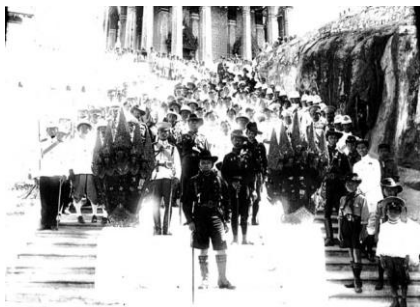
King Vajiravudh, royal family members, military officials, public officials, Wild Tiger Corps, royal scouts (all in khaki shirts and black pants) and royal pages students (in scout hats and short pants) took a photograph at the foot of naga staircase at the Buddha Footprint Mondop.