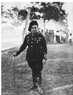
King Vajiravudh (Rama VI) in his Wild Tiger Corps uniform.

1 May 1911 King Vajiravudh founded Wild Tiger Corps. Wild Tiger Corps was Thailand's first semi-military troop founded as a territorial defense volunteer corps. King Vajiravudh gave his royal command to found the Wild Tiger Corps on 1 May 1911, for training of the royal court officials, merchants, civilians the militant's skills, in order to foster them to be disciplined, obedient to laws, loyal to the nation, religions and the Monarch, and to promote love, bravery, unity, strength, devotion, honesty and gratitude.